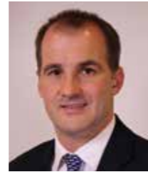
Jake Berry MP

A deal to drive economic growth in the area on both sides of the England/Scotland border has been discussed since 2013 as part of the UK Government's City Deal programme. City Deals take long-term, strategic, collaborative approaches to improving regional economies. Each deal is tailored to its region, reflecting its individual economic strengths and weaknesses, and comprises a programme of interventions to support positive and transformative change.