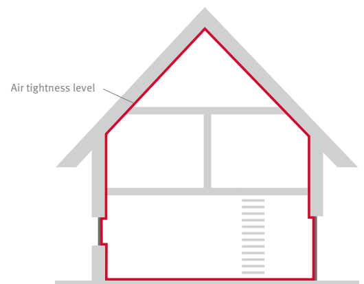
Fig. 2: Air tightness based on the example of a single-family home