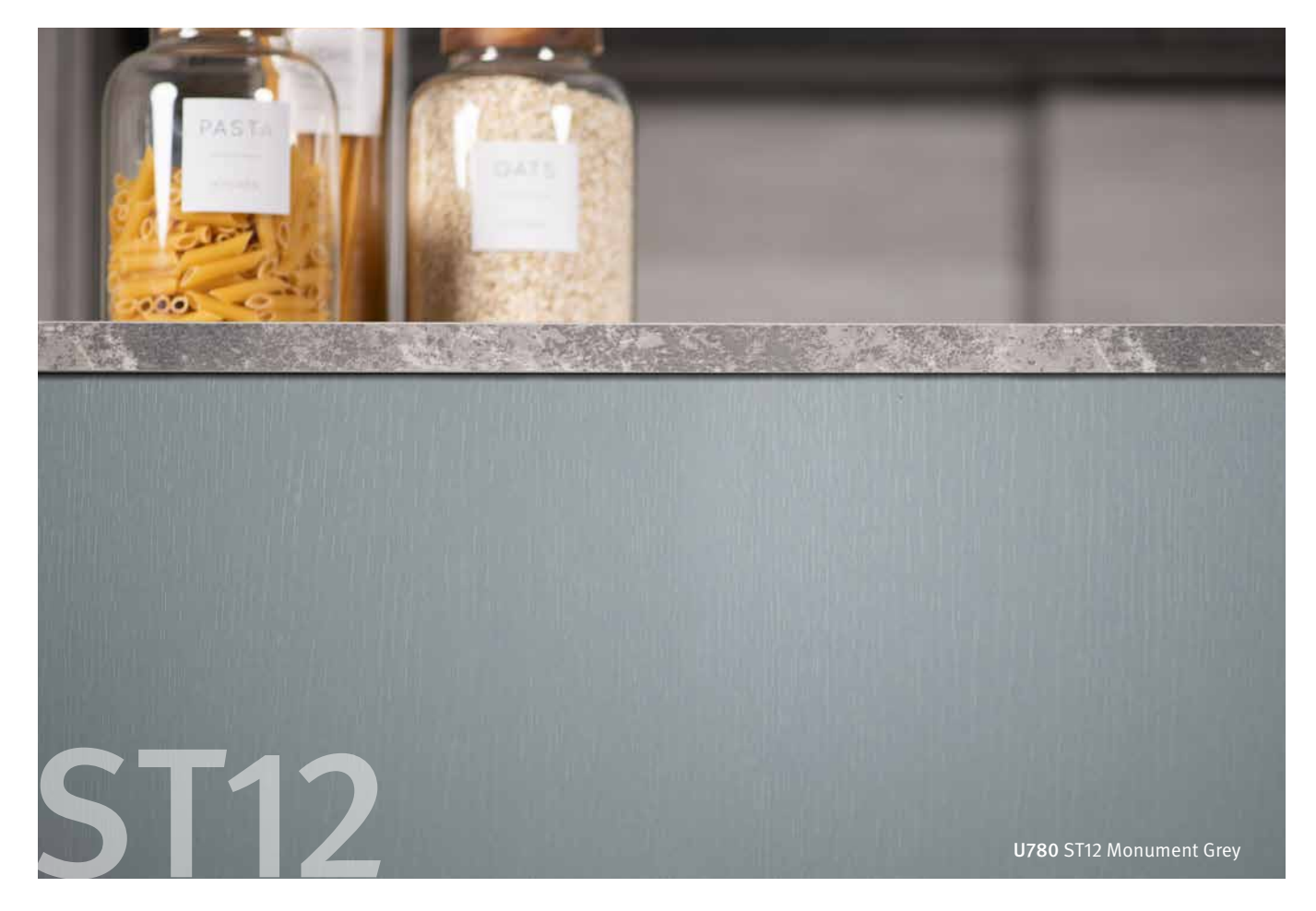
A subtle woodgrain texture gives this surface its natural look, suited to kitchen unit carcasses.