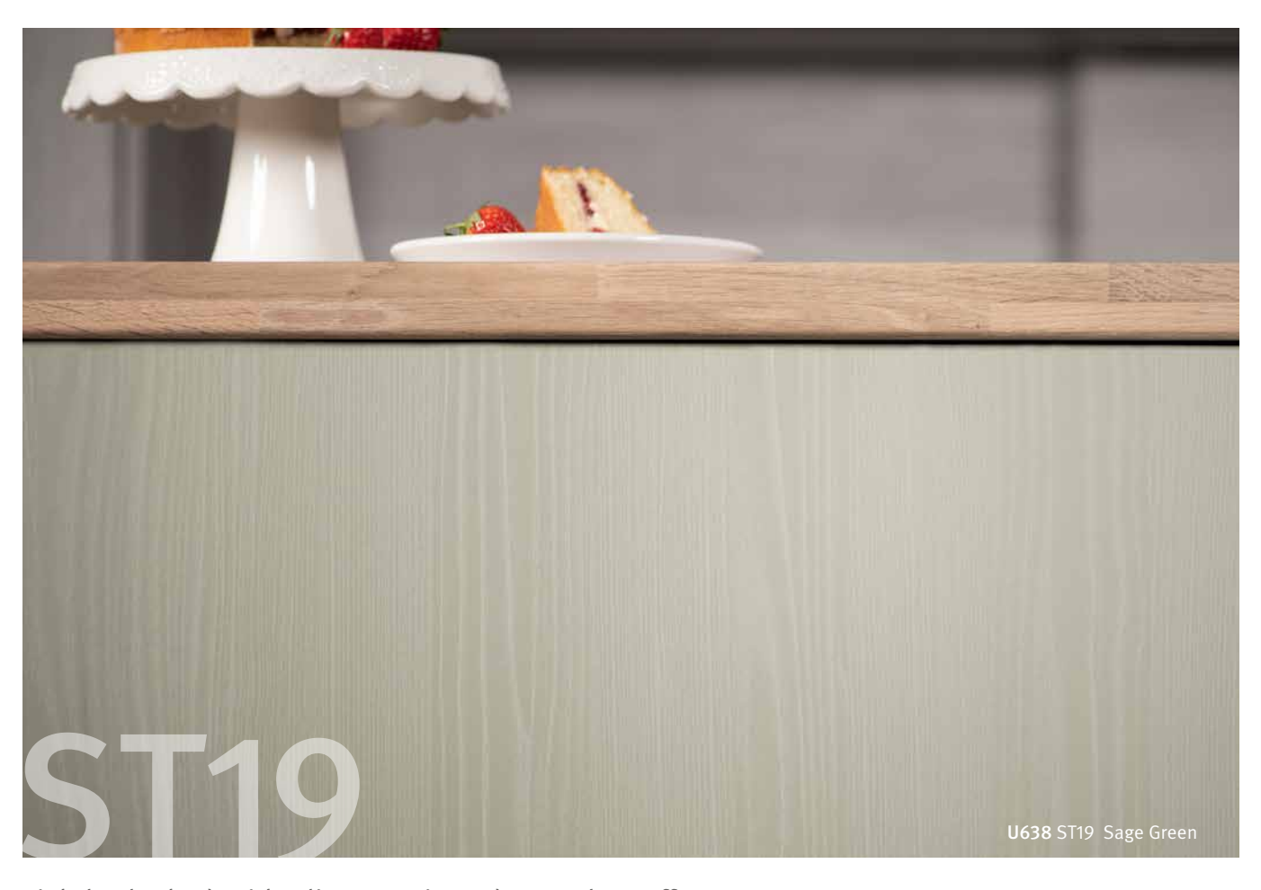
Lightly planked, with a linear grain and matt-gloss effect.