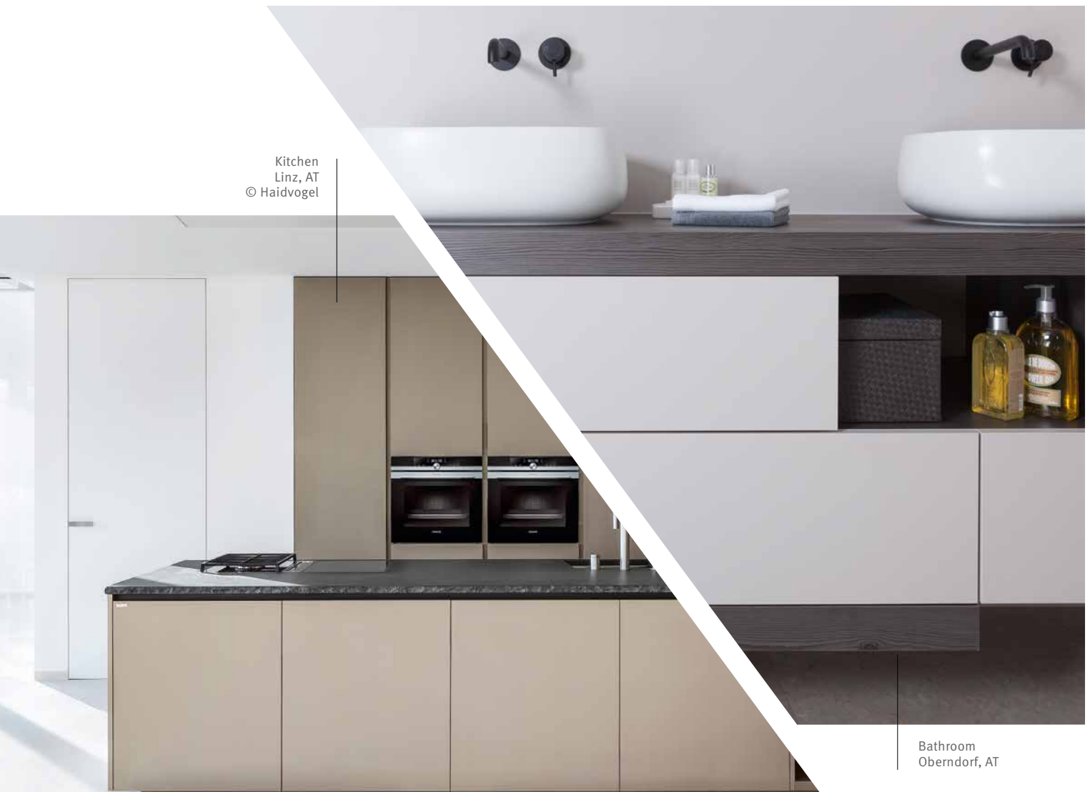
Bathroom Oberndorf, AT