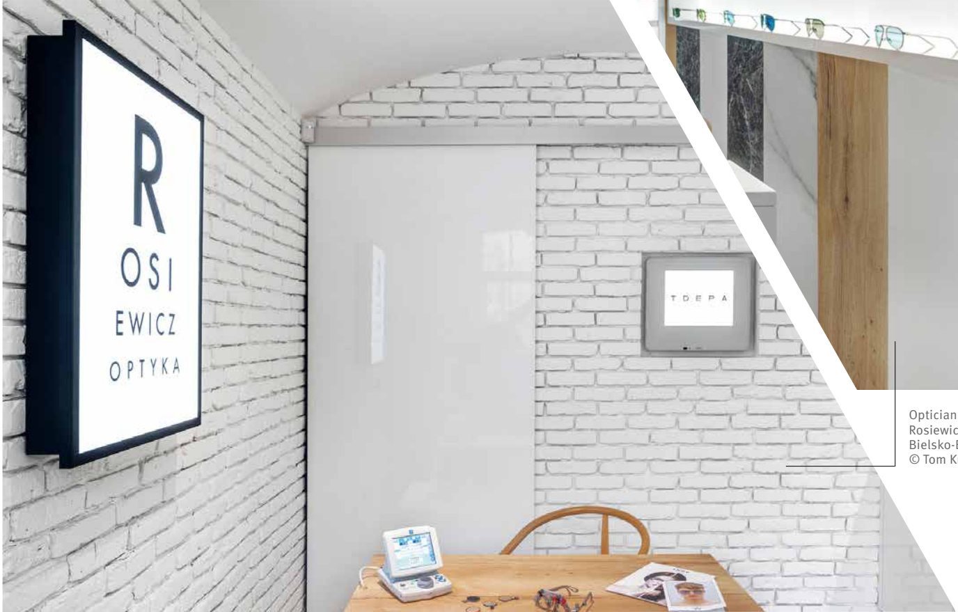
Optician Rosiewicz Optyka Bielsko-Biala, PL

Visually attractive with a sleek touch, the product is well suited for applications in residential and commercial areas, whether this is upscale retail or furniture design.