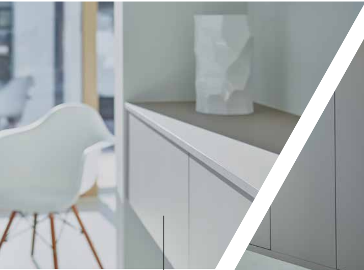
House Ismaning, Munich, DE