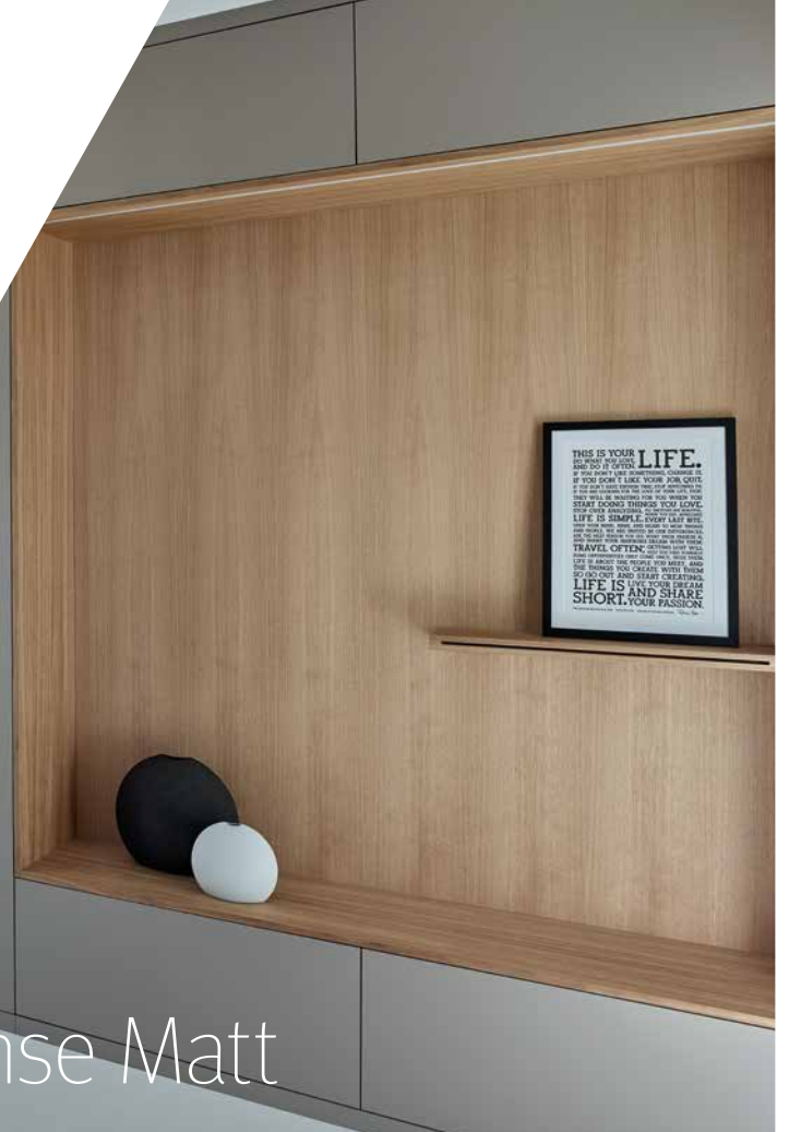
Kitchen Linz, AT