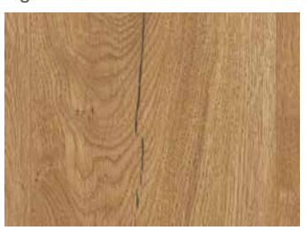
EPL144 Olchon Oak Honey