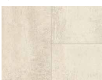
EPL168 White Chromix