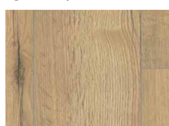
EPL159 Natural Valley Oak