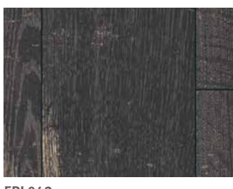
EPL042 Black Halford Oak