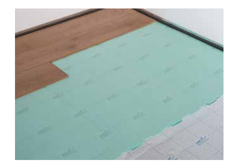
Silenzio Easy underlay mat