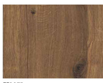
EPL075 Dark Dunnington Oak