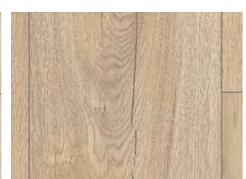
EPL142 Sand Beige Olchon Oak