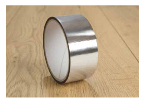
Aqua+ Alutape sealing band