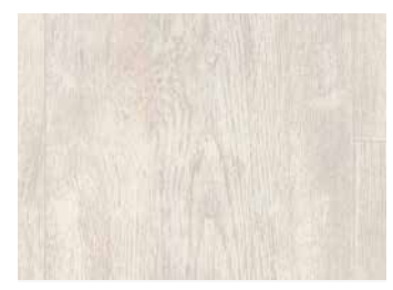
EPL188 Vintage Asgil Oak