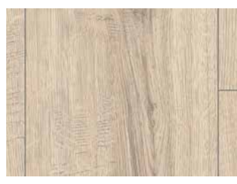
EPL183 Light Sherman Oak