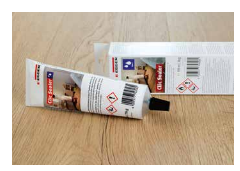
Aqua+ Clic Sealer