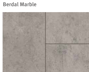
EPL166 Light Grey Chicago Concrete