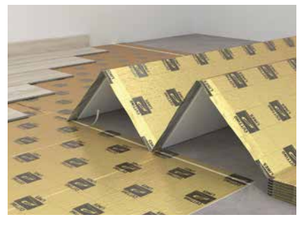
Silenzio Duo underlay mat