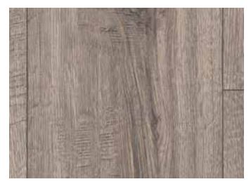
EPL185 Grey Sherman Oak