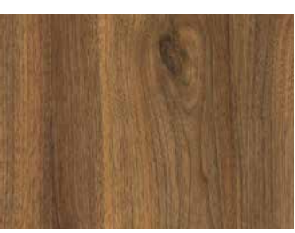
EPL067 Dark Langley Walnut