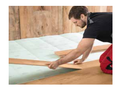
Easy to install

>> For more information on NALFA testing click here.