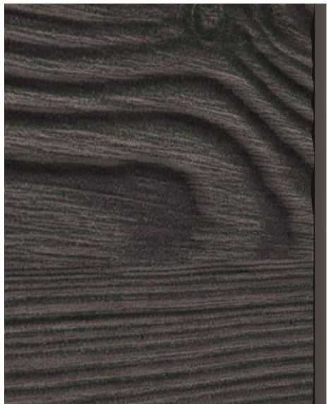
Fig. 2 - Edge protrusion -