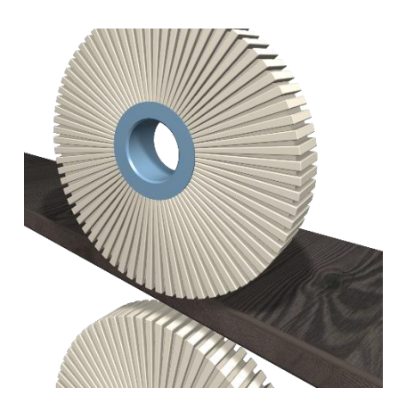
Fig. 3 – Milling bit –