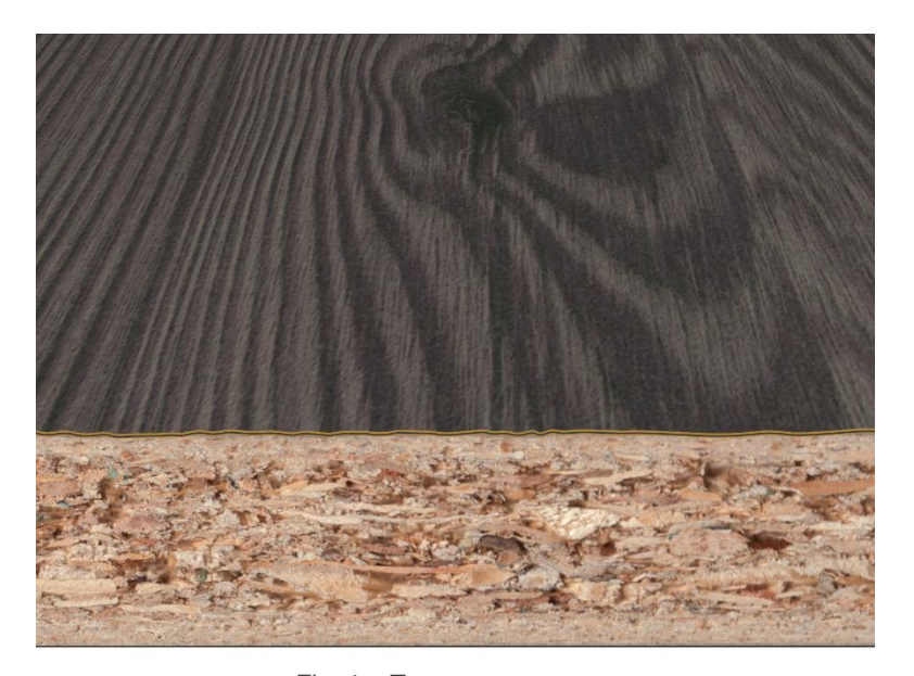
Fig. 1 – Texture geometry –

The texture geometry (ref. Figure 1) features alternating raised areas and depressions. The finishing units must be adjusted to the raised areas (texture elevations) to prevent damaging the surface of the board material. Due to this adjustment, as well as the texture-related alternation between "mountain and valley", there is an edge protrusion in the "valley" of the texture (ref. Figure 2) This protrusion in most cases is saturated with adhesive due to the edge location. Due to the process, this edge protrusion can't be avoided but adjustments can be made to reduce it. Proceed to remove as much adhesive as possible and round the edge slightly to reduce sharpness.