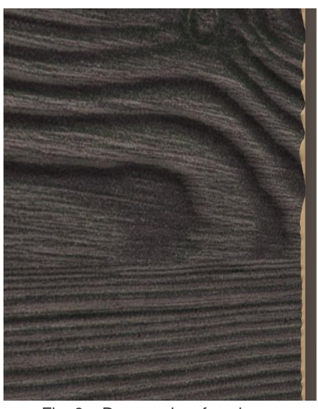
Fig. 6 - Damaged surface layer -