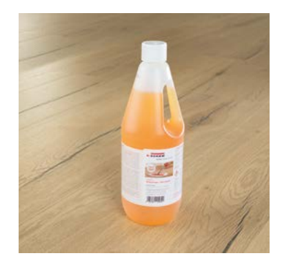
More information: www.egger.com/flooring-accessories

With EGGER care products you always have the right product at hand.