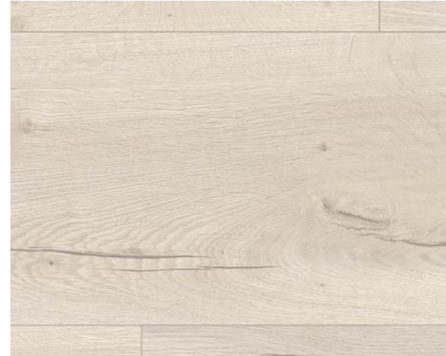
ED7003 Creme Halifax Oak