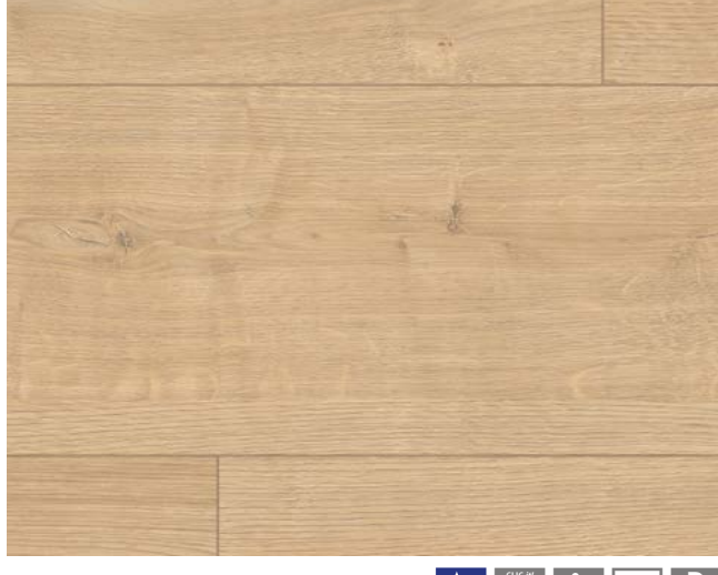
ED7001 Light Brown Berdal Oak