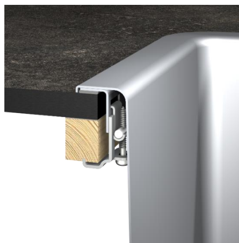
Fig. 2 – Compact laminate worktop