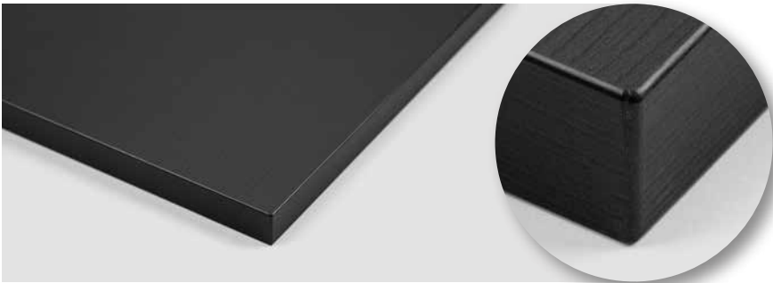
ABS Seamless Edging U999 TM28