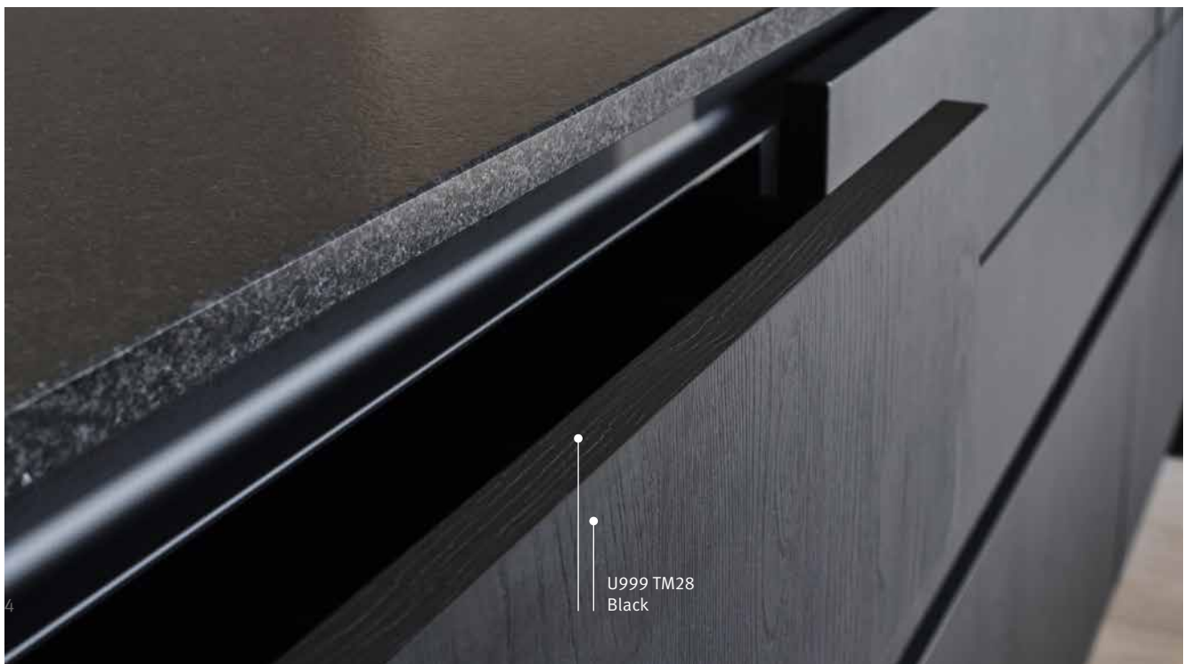
U999 TM28 Black

** Detailed information can be obtained from the sales representative in charge