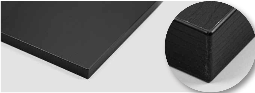
Conventional edging U999 TM28