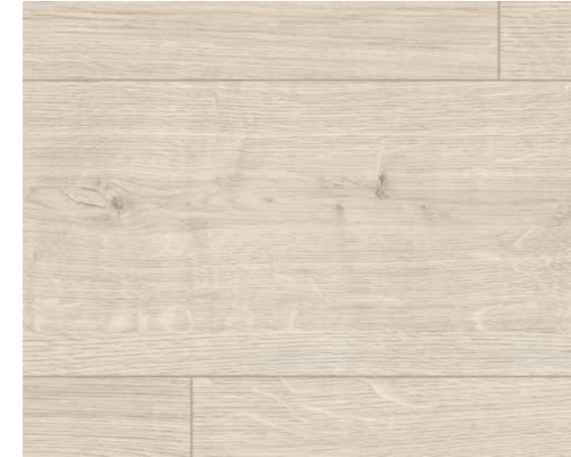
ED7000 White Berdal Oak