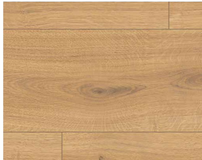
EL1005 Honey Predaia Oak Art.-No.: 566171 8/32 Classic Skirting Art.-No.: 572264 8/33 Classic L613