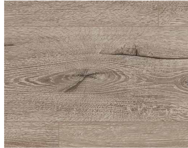
EL1006 Grey Melba Oak Art.-No.: 566355 7/31 Classic Skirting L609