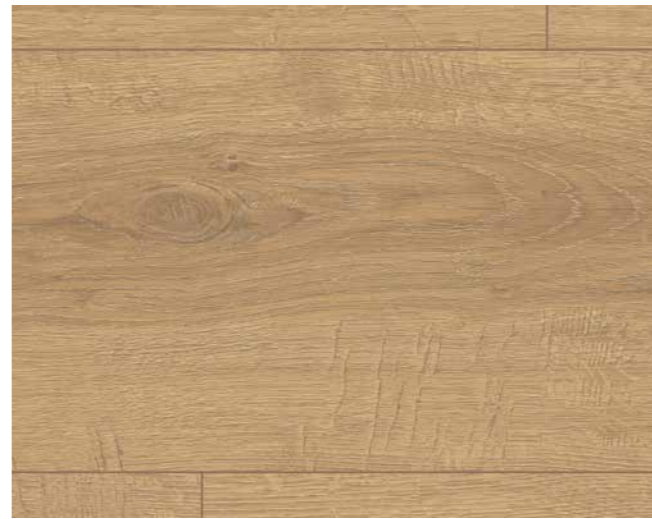
EL1007 Honey Sherman Oak Art.-No.: 566539 8/32 Large Skirting L624