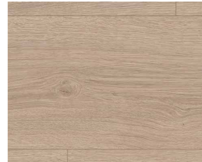
ED7002 Light Brown Victoria Oak