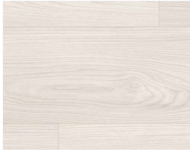
EL1003 White Sheffield Acacia Art.-No.: 566232 8/32 Classic Skirting Art.-No.: 572325 8/33 Classic L610