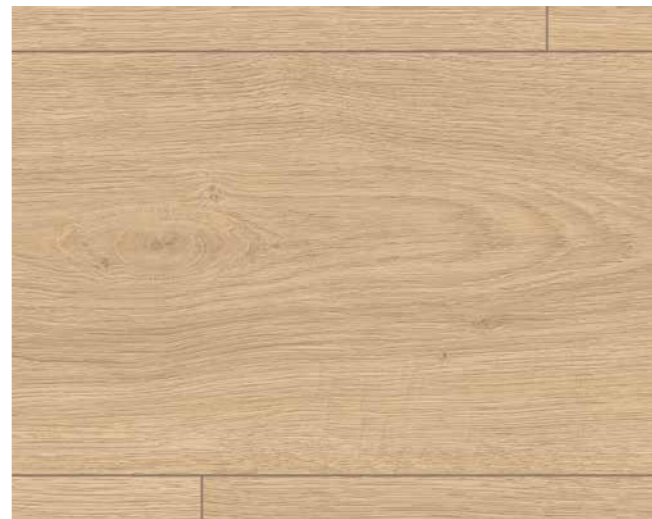
EL1009 Natural Victoria Oak Art.-No.: 566478 8/32 Large Skirting L612