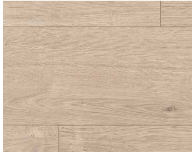
EL1000 Light Berdal Oak Art.-No.: 566294 7/31 Classic Skirting L608