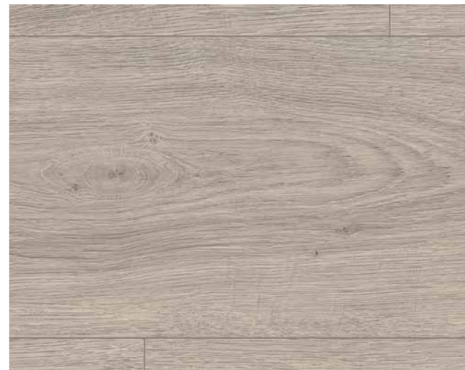
EL1010 Light Grey Victoria Oak Art.-No.: 566447 8/32 Large Skirting L616