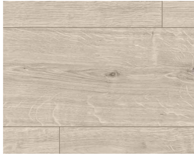
EL1001 Grey Berdal Oak Art.-No.: 566263 8/32 Classic Skirting Art.-No.: 572295 8/33 Classic L611