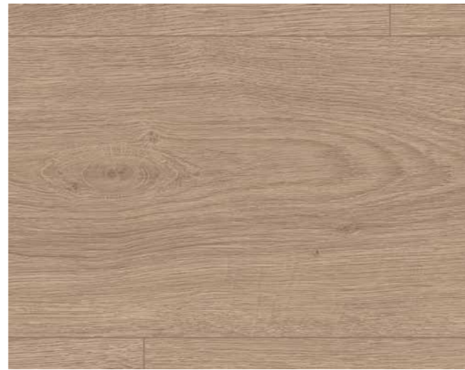
EL1011 Brown Victoria Oak Art.-No.: 566416 8/32 Large Skirting L617