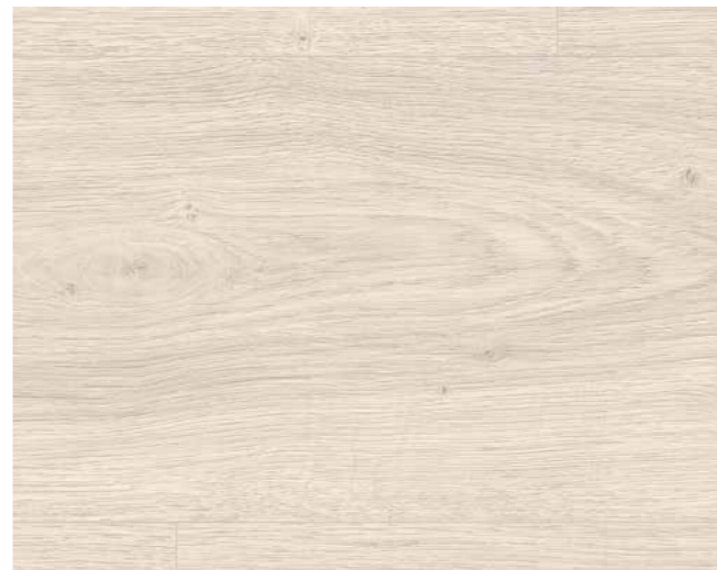
EL1008 White Victoria Oak Art.-No.: 566508 8/32 Large Skirting L615