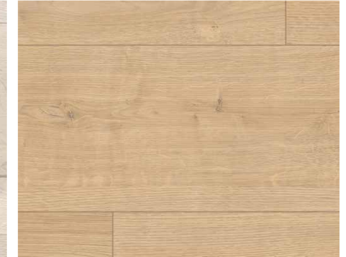
ED7001 Light Brown Berdal Oak