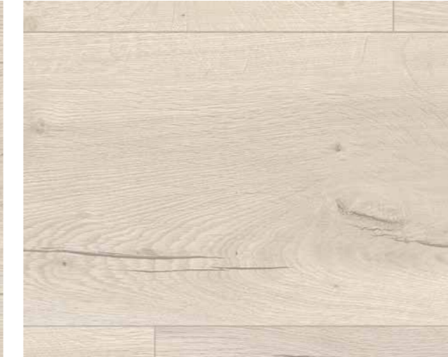
ED7003 Creme Halifax Oak