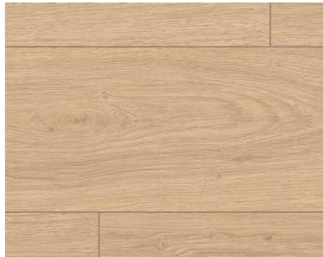
EL1009 Natural Victoria Oak Art.-No.: 566119 8/32 Classic Skirting Art.-No.: 572387 8/33 Classic L612