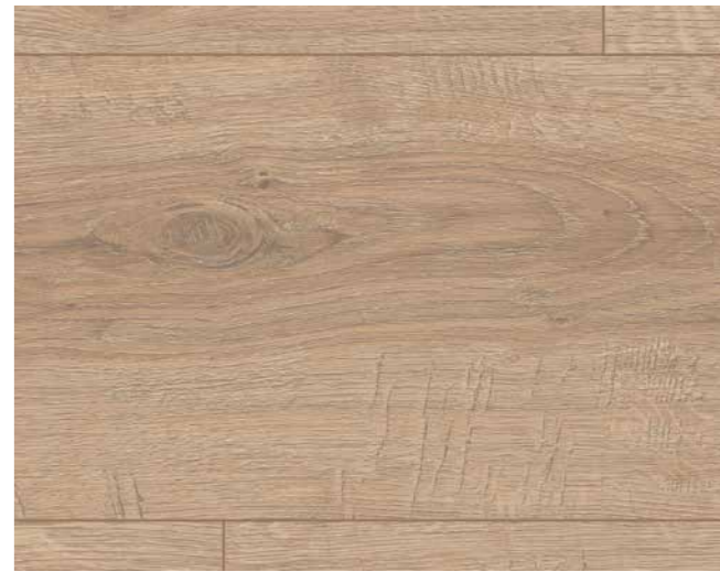
EL1012 Brown Sherman Oak Art.-No.: 566386 8/32 Large Skirting L625