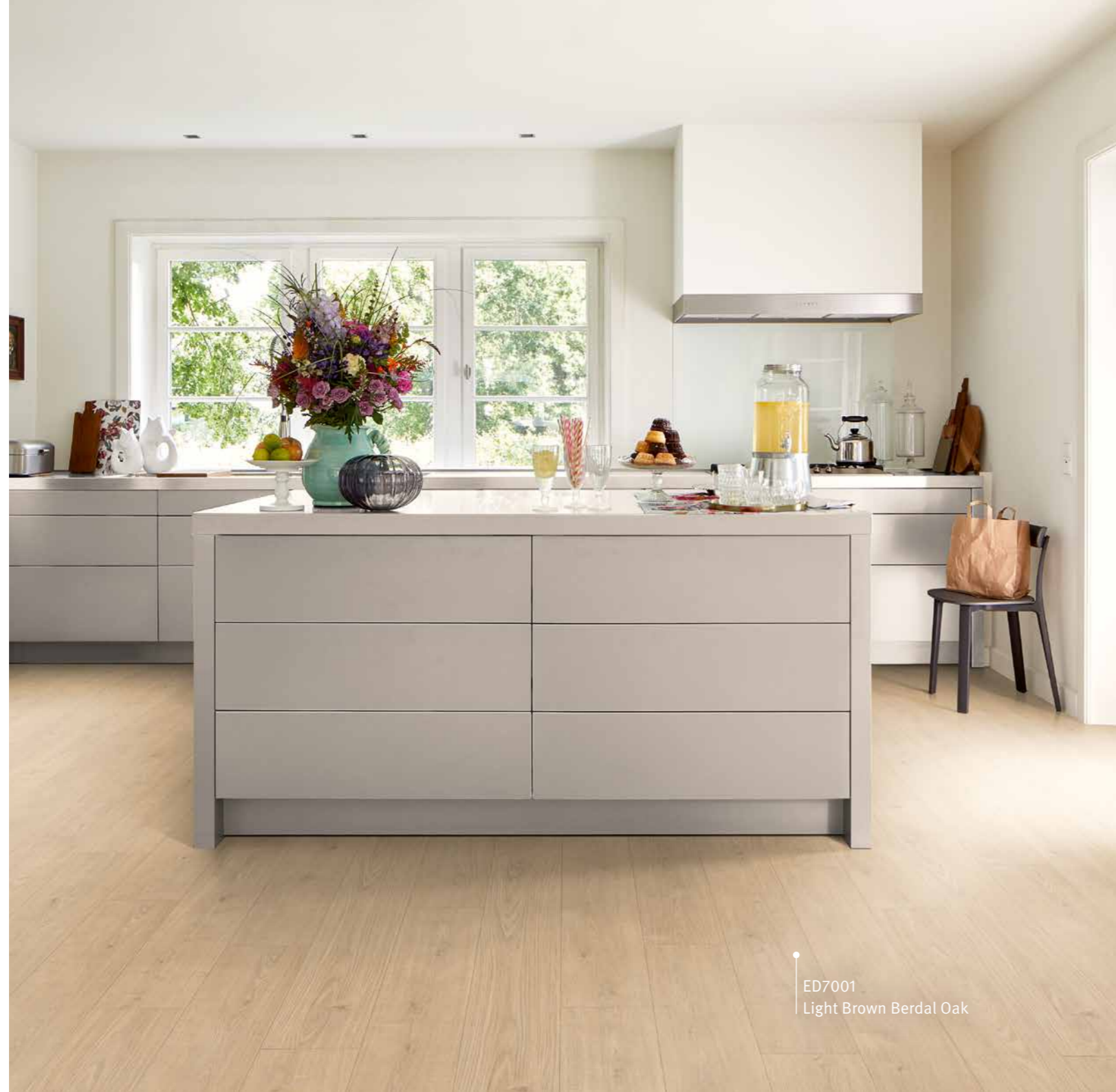
ED7001 Light Brown Berdal Oak