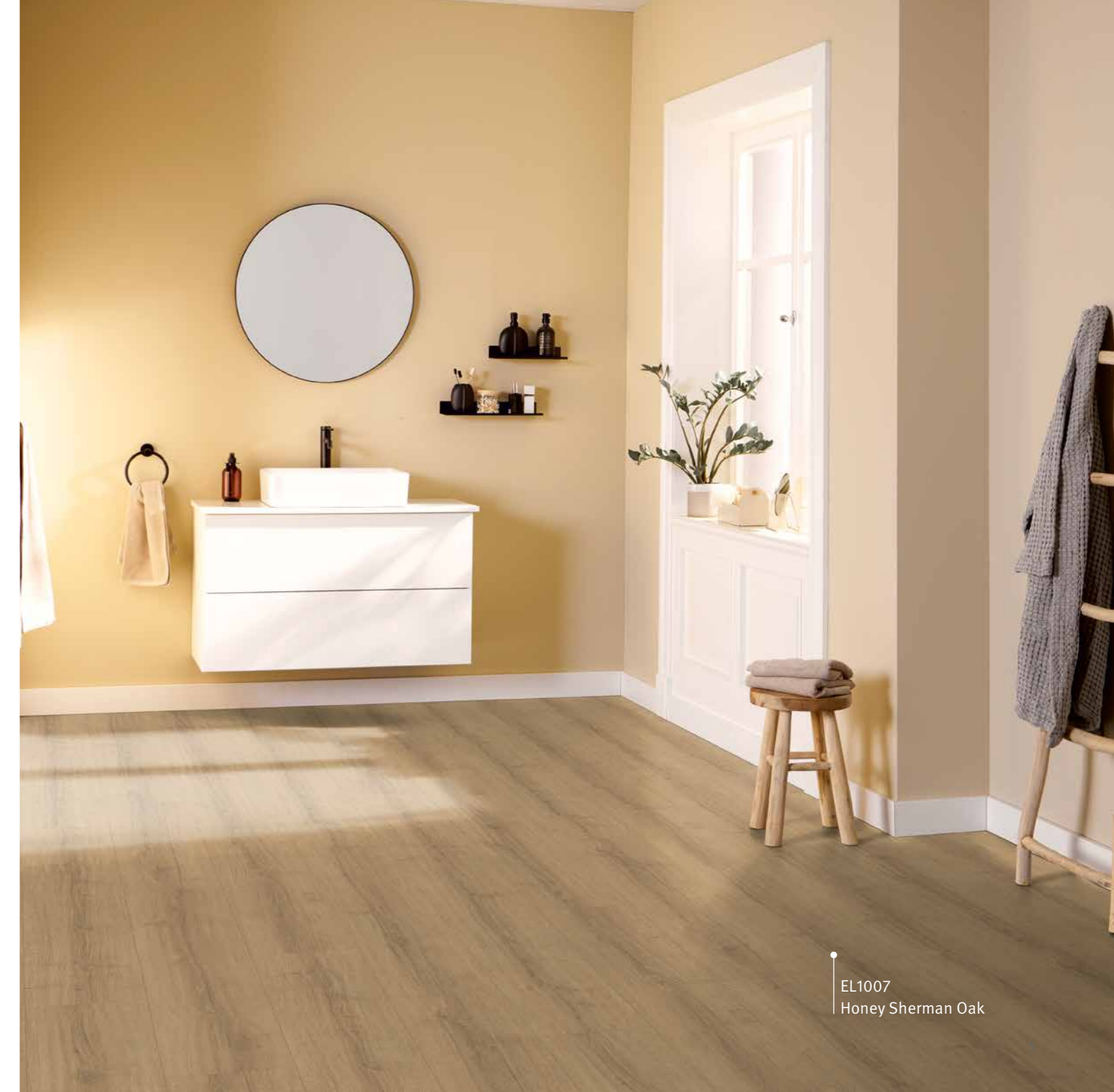
EL1007 Honey Sherman Oak

To see all available Laminate Flooring decors, please visit egger.com/laminate-flooring