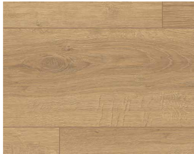
EL1007 Honey Sherman Oak Art.-No.: 566140 8/32 Classic Skirting Art.-No.: 572356 8/33 Classic L624