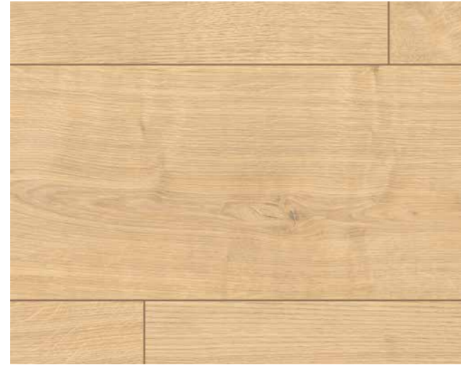
EL1002 Light Brown Berdal Oak Art.-No.: 566324 7/31 Classic Skirting L623