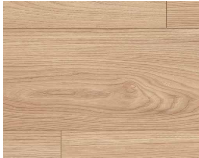
EL1004 Natural Sheffield Acacia Art.-No.: 566201 8/32 Classic Skirting Art.-No.: 572233 8/33 Classic L614