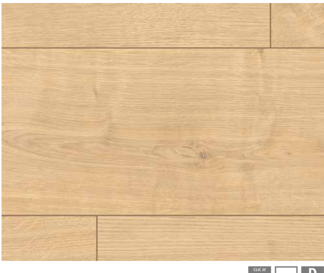
EL1002 Light Brown Berdal Oak 7/31 Classic Skirting Art.-No.: 566324