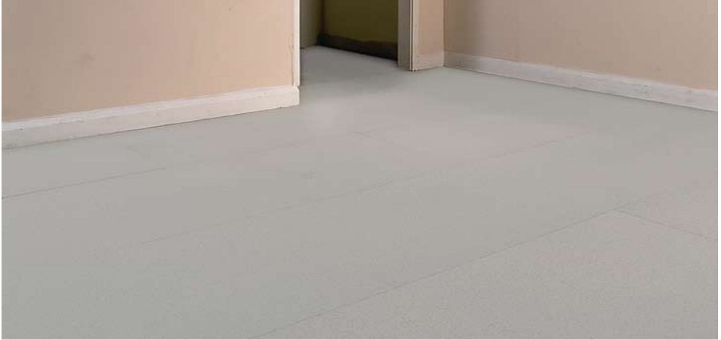
EGGER Protect finished flooring.